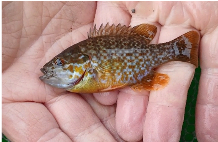
Green Sunfish-Pumpkinseed Hybrid